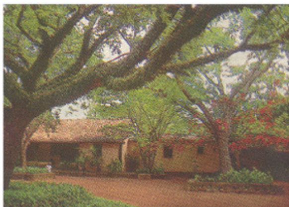
ABOVE: The house where guests are lodged at Hato Piñero.