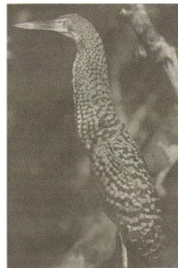
Rufescent tiger heron.

After lunch we relaxed in our room, reading or napping for a few hours, before setting out on another drive around 4 P.M. We usually returned after dark, around 8, when different animals appeared. When the sun went down, the guide and spotter raked the